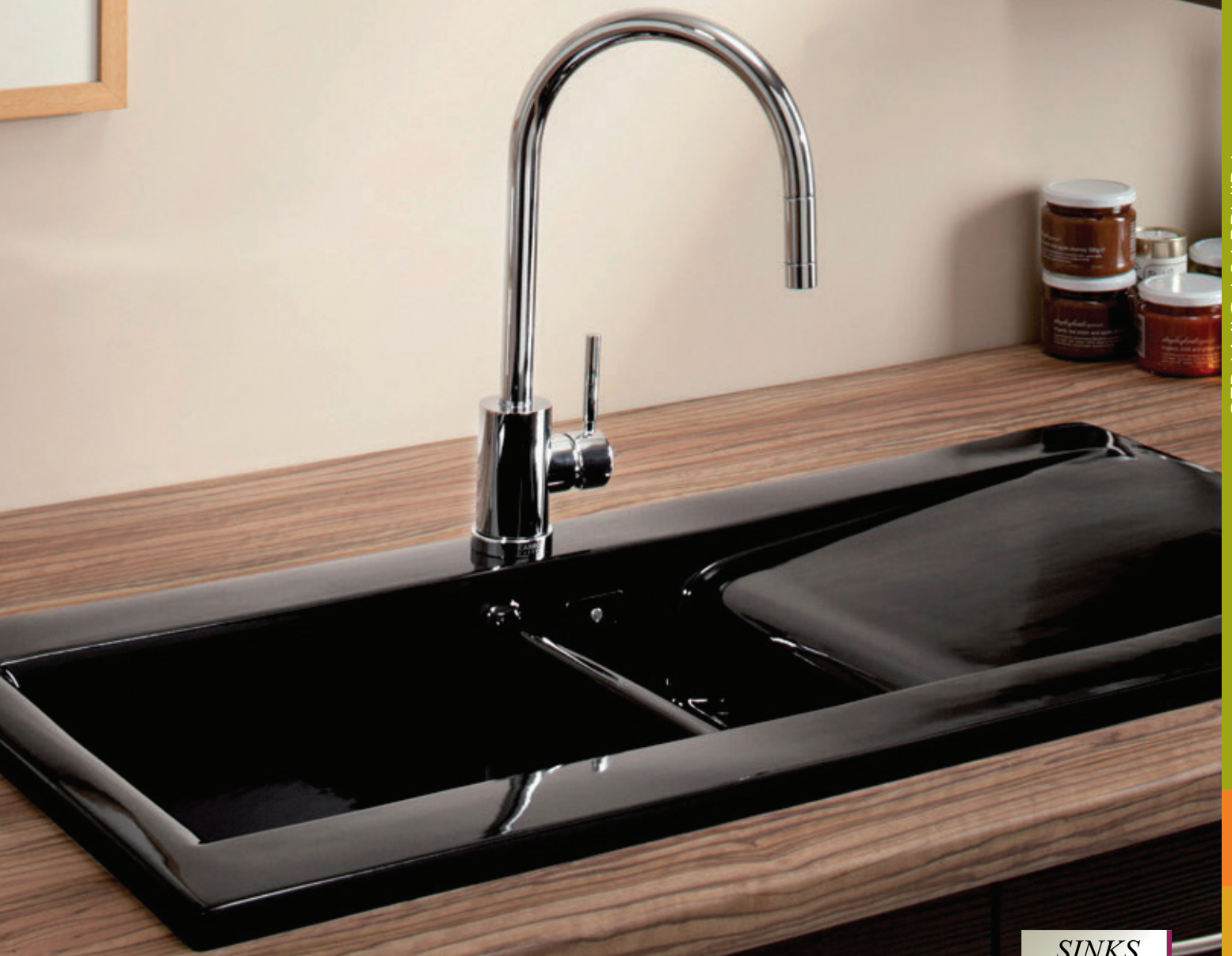
Sapphira 150 shown in gloss black